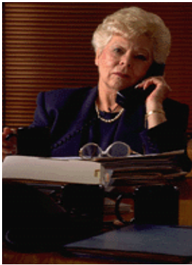
Who answers my call?

When you call 911, your call is answered by an emergency dispatcher whose first responsibility is to find out